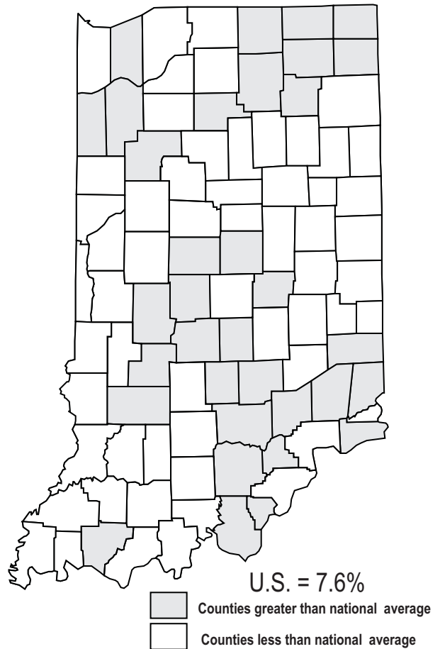
Indiana County Population Change Compared to National Average, 1990 to 1997