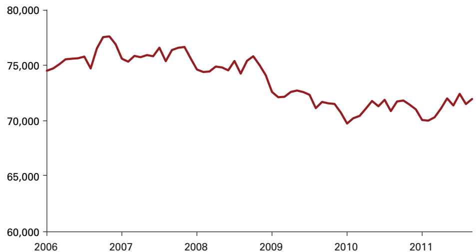
FIGURE 1: Terre Haute Regional Employment, January 2006 to September 2011