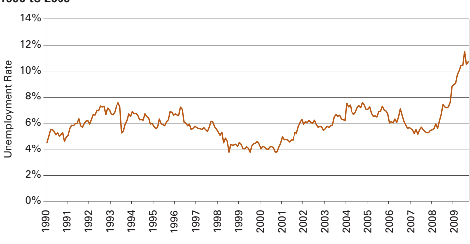
FIGURE 1: Terre Haute Metro Unemployment Rate (Seasonally Adjusted), 1990 to 2009

is down more than 10 percent (from 77,460 to 69,615) from the beginning of the recession, and the local labor force, while essentially remaining stagnant since 1998, has experienced a noticeable decline over the last two years (see Figure 2 ). This decline illustrates what economists call the "discouraged worker effect," and helps explain the dip in the local unemployment rate